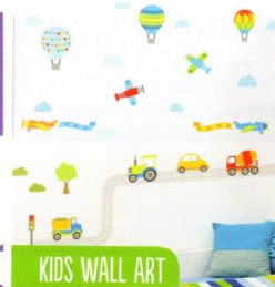
KIDS WALL ART

GET FREE* DELIVERY WHEN YOU SHOP ONLINE: WWW.BRIGHTSTARKIDS.COM.AU